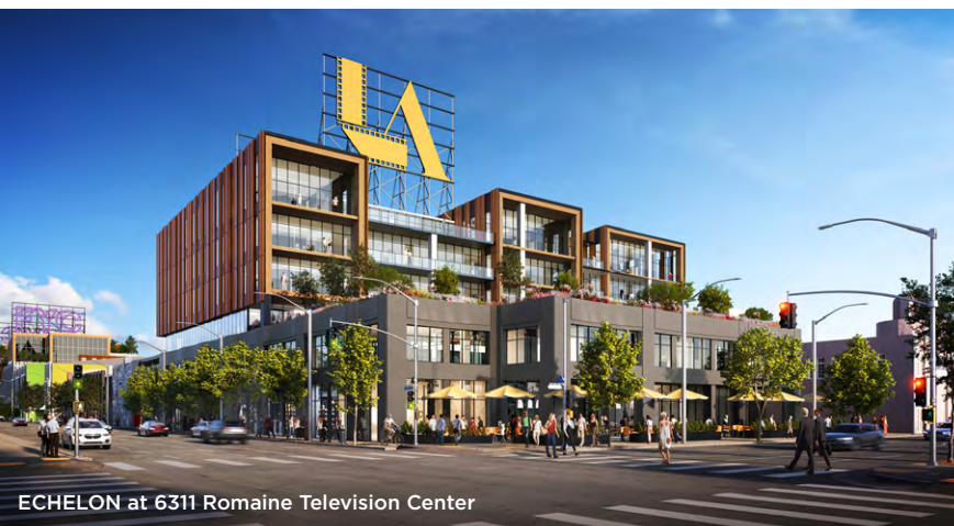
ECHELON at 6311 Romaine Television Center

On the northern block, the original art-deco facade will enclose a “lively” studio lot, bookended by a new mid-rise creative office building with ample private outdoor terraces framing views of the Hollywood Hills. The new construction will replace a parking lot and two dilapidated buildings on Santa Monica Boulevard. On the southern block, a vacant parking lot will be given new life with four large soundstages flanking an expansive basecamp, capped by a six-story office building offering tailored creative office space, production support space, as well as private rooftop office bungalows and decks.